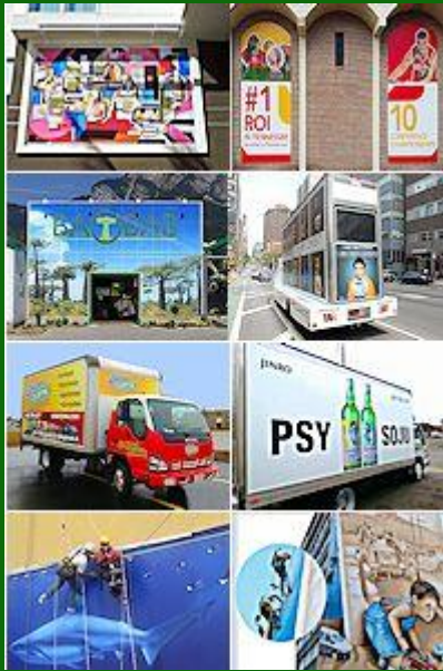
Realized With A Handful of Extrusions...!