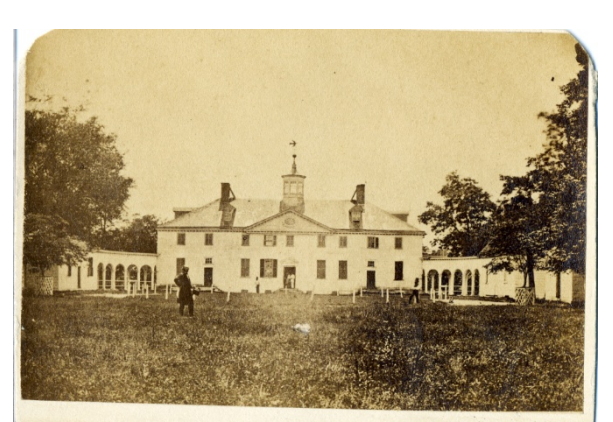
George Washington's Mt. Vernon Plantation – Slave Quarters Left of House