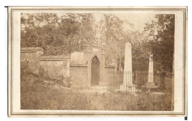
Washington's Burial Site at Mt. Vernon

Of all the founding fathers, only Washington is unequivocal in his determination to eventually free all of his slaves. Fearing that a future executor might waver, he issues a military-like command: