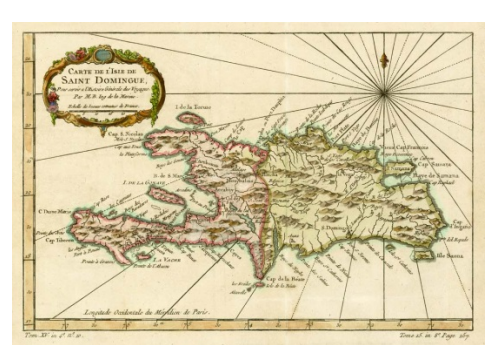
Hiapaniola Island, with the Western Third Saint-Dominigue (Later Haiti)