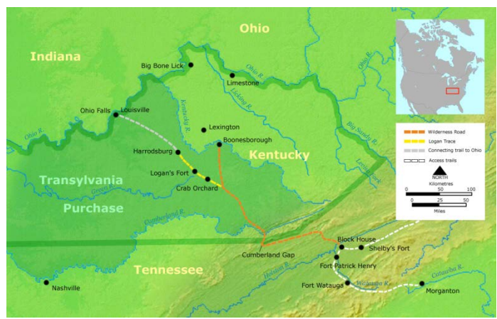
The Transylvania Purchase And Cumberland Gap

But Boone is already familiar with a depression known as the Cumberland Gap, and a path through it that will become known as the Wilderness Road -- a well-travelled route the tribes have used for generations, moving east and west. In early 1775 he guides some thirty pioneers over this path to the Kentucky River, where he founds the settlement of Boonesborough (near Lexington).