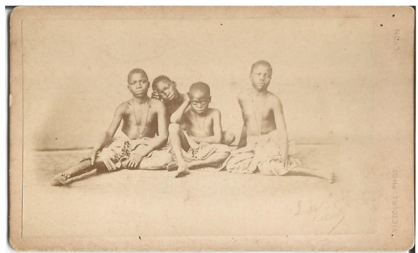
Four Slave Boys

While white American are striving to get ahead in 1790, slaves are simply trying to survive.