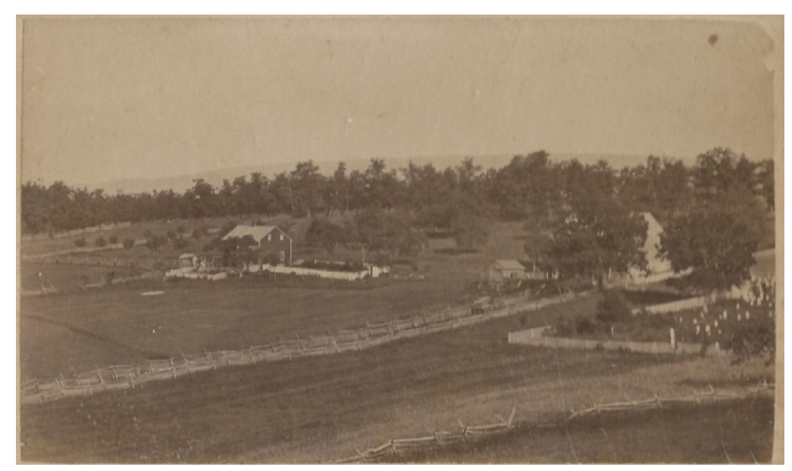
Typical American Rural Landscape: Farms and a Cemetery

In 1790, "home" for 93% of all Americans is in the countryside, on the family farm.