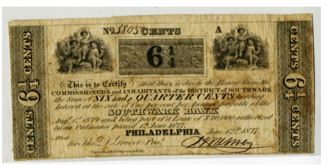
A 6 1/4 Cent Bond from the Bank of Philadelphia

While tracking economic growth in the antebellum period is more of an art form than a science, many scholars have tried to patch together data from various sources to estimate what we would now call the nation's gross domestic product (GDP).