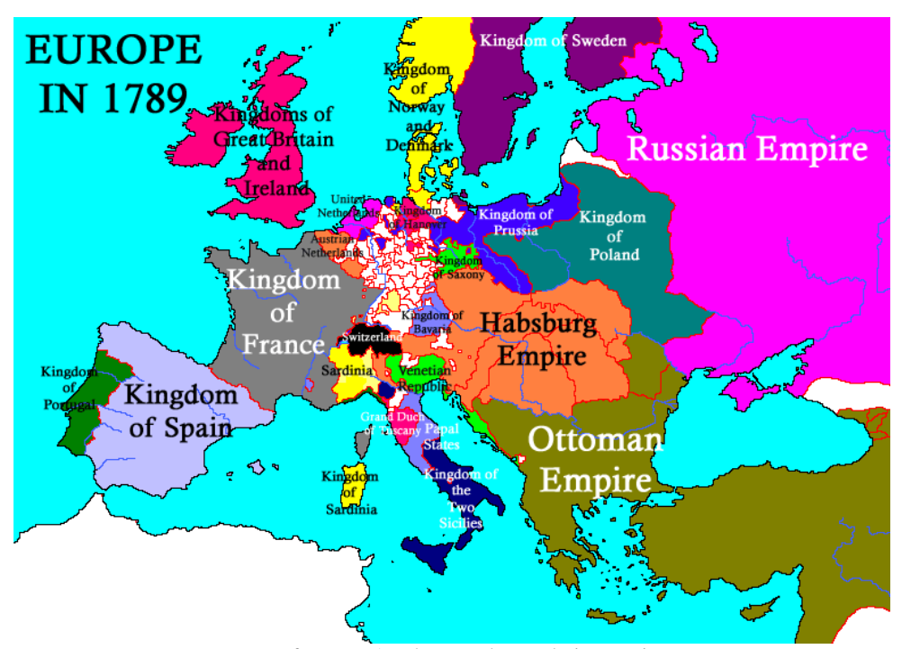
January 21, 1793 King Louis XVI Is Guillotined And Robespierre Takes Power

Map of Europe As The French Revolution Begins