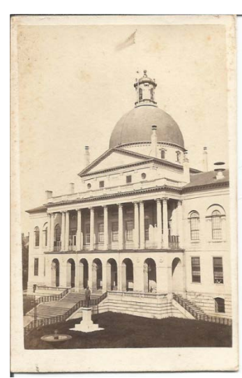
Massachusetts State House