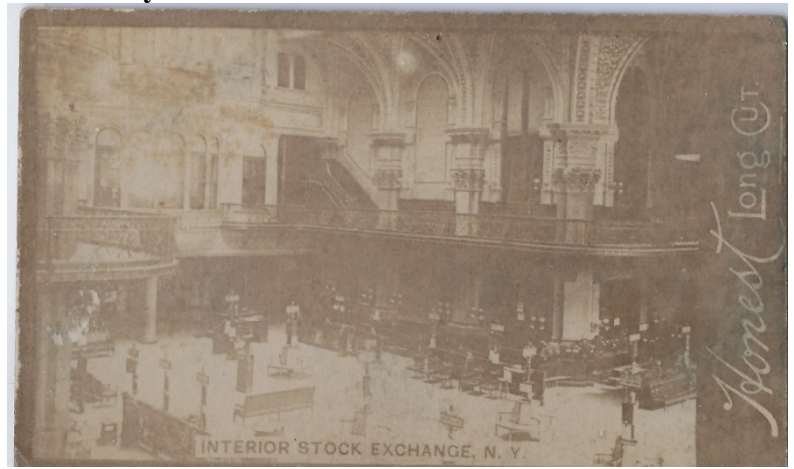
Interior of the New York Stock Exchange, Started Up in May 1792

Hamilton Floats U.S. Treasury Bonds To Add More Revenue