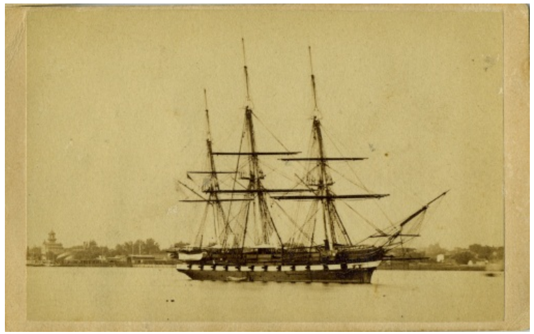
U.S.S. Constitution, Commissioned in 1797.

Adams Tries Again To Settle The Quasi-War With France