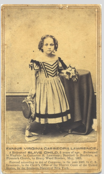
Casseopia, "A Slave Girl of N.O.

Sidebar: Phyllis Wheatley – Young And Gifted And Black