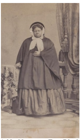
A No-Nonsense Free Black