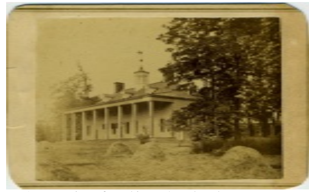
A Front View of Washington's Beloved Mt. Vernon

In retirement, Washington pursues his art collection, oversees his plantation and begins to worry about mortality and about the fact that he finds himself land rich, but cash poor. To cover his sizable living expenses he begins to aggressively sell off his large land holdings in the west.