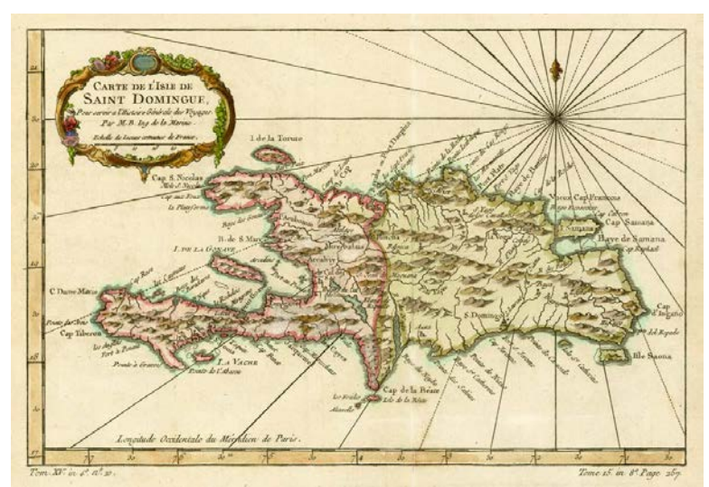
French Colony Of St. Domingue (In Red) -- Site Of Louverture Rebellion

Starting in August 1791 a remarkable revolution is carried out on the French colony of Saint-Domingue by black slaves, under the leadership of one Toussaint Louverture.