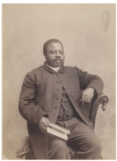
A Later Day Black Preacher

Standing from sun-up to sun-down in bug and worm infested dirt or mud or ankle deep water to cultivate rice, tobacco or cotton becomes the lot of the southern slaves. It is punishing labor and intensely monotonous. It is marked by fear at any moment of the lash, delivered by a displeased or arbitrarily sadistic overseer. It is also endless. The only way out is death, and death is all around, in the faces of young and old, men and women and children, all accelerated by meager rations, run-down living quarters and flimsy attire.