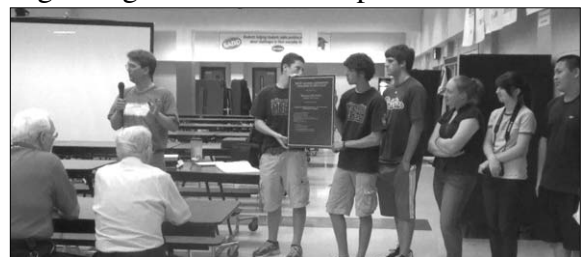
Methacton High School accepts first Place in Battery Only Conversion Category.

Methacton High School: Two Seated Lomax, Three Wheeled, First Place in Local Lightweight Div. 920/1000 pts.