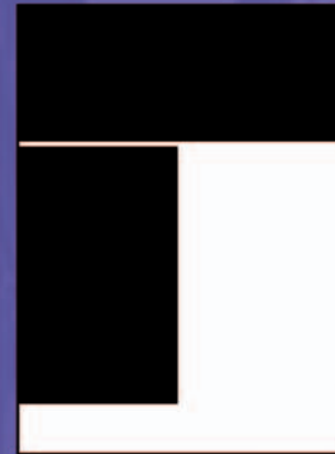
Third Page H & V H - 10.25"w X 4.25"h V - 5"w X 8"h