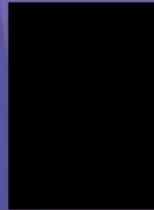
Full Page 10.25"w X 14.0"h