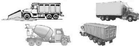
Single-Unit (3 or More Axles)