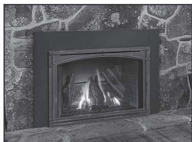
Direct Vent Gas Inserts