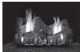
Radiant Heat Gas Logs

It's Always BBQ Season with the Big Green Egg!