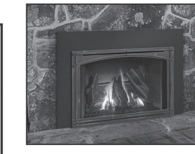
Direct Vent Gas Inserts