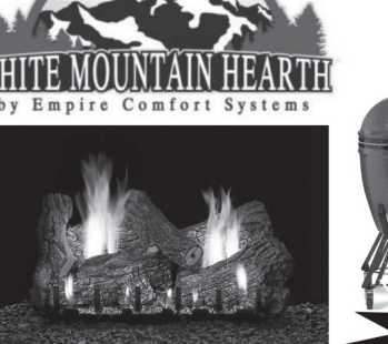
Radiant Heat Gas Logs