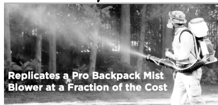
Replicates a Pro Backpack Mist Blower at a Fraction of the Cost

This handy lil' gadget hooks on to your leaf blower and gets the BT mixture up in the tall sections of your trees!