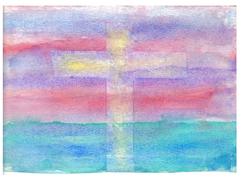
"No longer shall the sun be your light by day, Nor the brightness of the moon shine upon you at night; The LORD shall be your light forever, your God shall be your glory." Isaiah 60:19