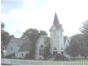
Lamoille Community Presbyterian Church