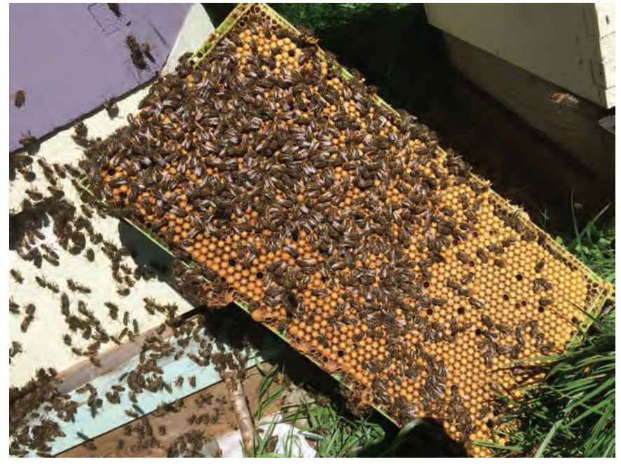
A frame of Carniolan drone brood in Washington, in April 2015. To rear a plentiful supply of drones to maturity from select colonies can be challenging.

The pre- and post-insemination care given to IIQs affects sperm migration and queen performance. The claim that IIQs do