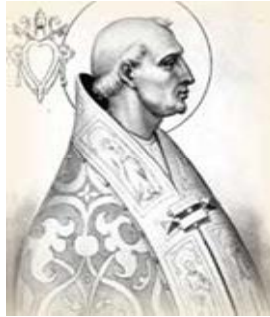
Ecumenical Patriarch Michael Cerularius

with unleavened bread , which the Eastern Church condemned. The Eastern Church began dipping the bread in the wine and that was condemned by the Western Church.