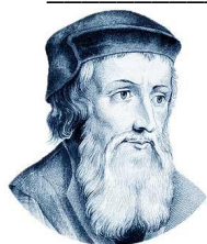
John Wycliffe (c. 1329-1384)