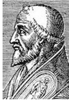
Roman Pope Leo IX

The final break began in 1053 when Michael Cerularius, Patriarch of Constantinople , circulated a treatise criticizing in strong terms the practices of the Western Church . Cerularius excommunicated all bishops of Constantinople who used the Western Church's rituals and closed down their churches. A very angry Pope Leo IX demanded that Cerularius submit to the office of the Pope, and declared that any church which refused to recognize the pontiff as supreme was an assembly of heretics -- a synagogue of Satan.