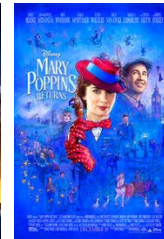
MARY POPPINS RETURNS 1/12