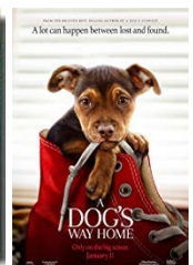
A DOGS WAY HOME 1/26