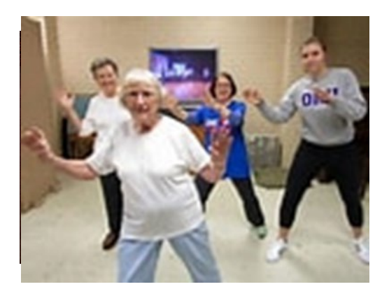
Tue & Fri 9:00 am