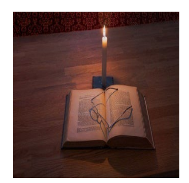
Tue 10:00 am Men