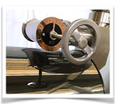
NEW FOR 2018! MDDS AIRFLOW SYSTEM FOR PRECISE AIRFLOW