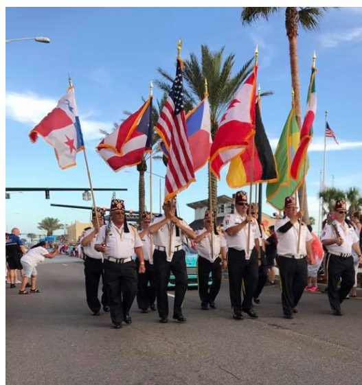
Egypt Legion of Honor Unit carrying the colors at the 2017 Imperial parade