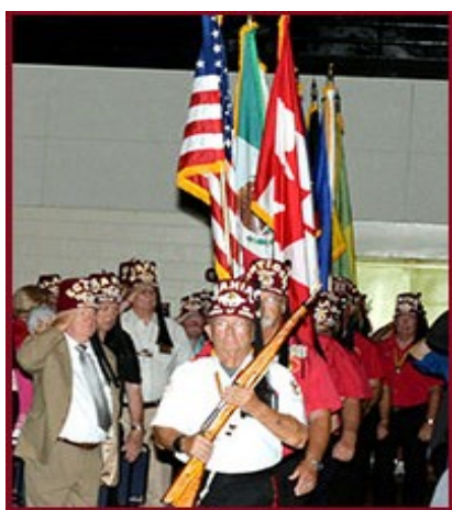
IALOH Posting The Colors At the 2017 Imperial Session

The Imperial Session will be held in Dayton, FL from July 15 - 19, 2018. The IALOH meeting will take place Sunday July 15th at 1000 hours at the Ocean Center Convention Center. For the members that attended last year it is in the same room as last year. The IALOH Officers will be posting the colors at the opening ceremony and we will have an information booth in the vendor area to inform members about the International Legions of Honor. So drop by and say hello.