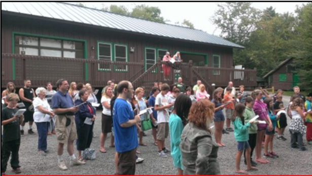
103 youth, adults and clergy from 11 parishes across the Eastern Diocese gathered at Camp Howe in Goshen, Massachusetts

The youth of our parish have many opportunities to meet with other youth in our churches. Within our Diocese, many youth (ages eight and older) participate in the Diocesan Youth Retreat, held every August at Camp Howe in Goshen, MA. The youth also have the opportunity to attend a Winter Youth Gathering and Acolyte Retreat. All these events are prepared on a Diocesan level to give the youth of our church the possibility to learn how to love God and others and how to be Christian in everyday life.