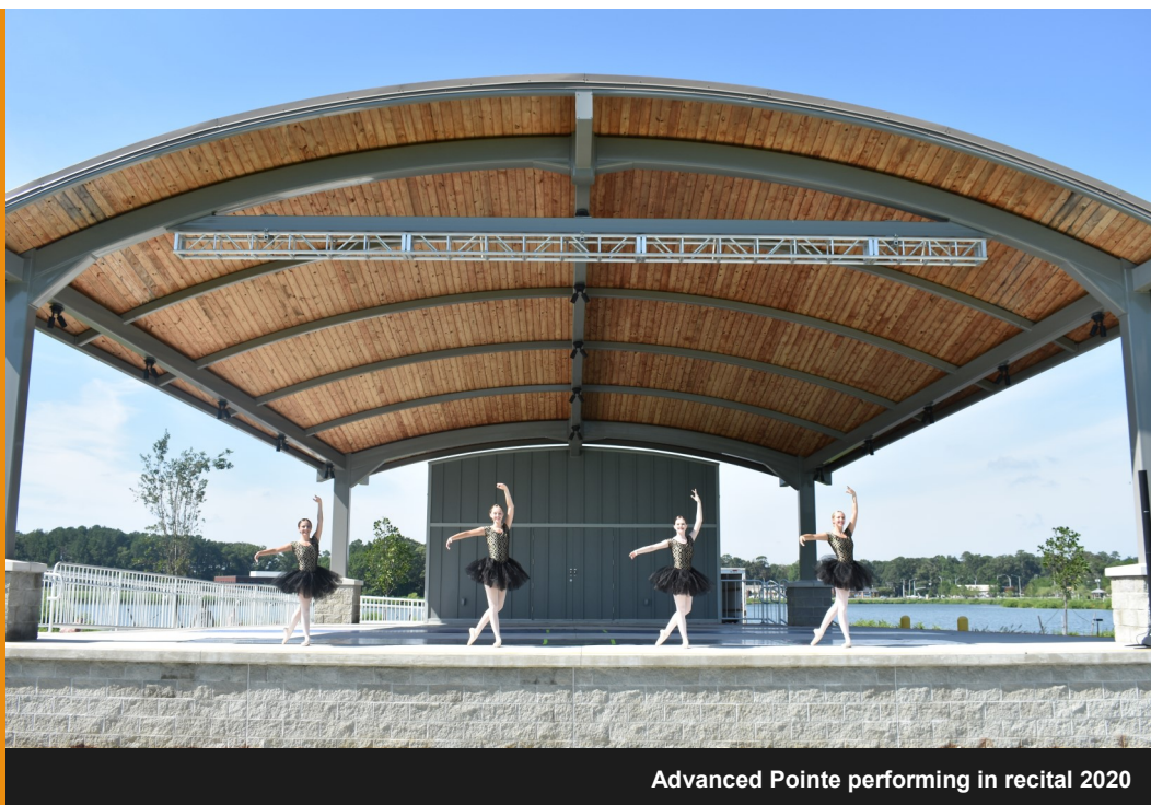
Advanced Pointe performing in recital 2020