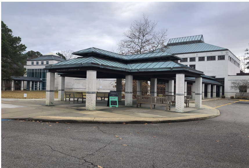
Virginia Museum of Contemporary Art entrance; view from the parking lot