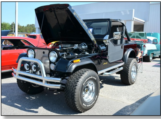
See page 2 for a list of the Show Winners