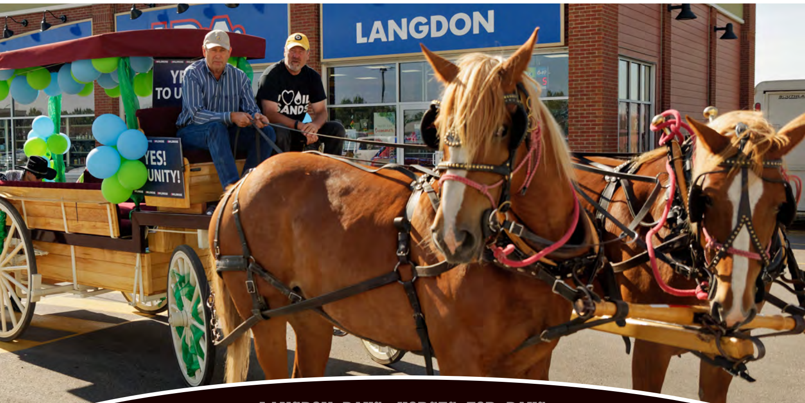
LANGDON DAYS: HORSES FOR DAYS

Shopping Show & Shine Entertainment Beer Gardens Fireworks Parade Dancing Beer Gardens Craft Beer Tasting Ball Tournament Fire Trucks Laughing Entertainment Pancake Breakfast Food Trucks Cool Cars Pancake Breakfast Kids Zone Shopping Fun Friends Horses Craft Beer Tasting Dancing