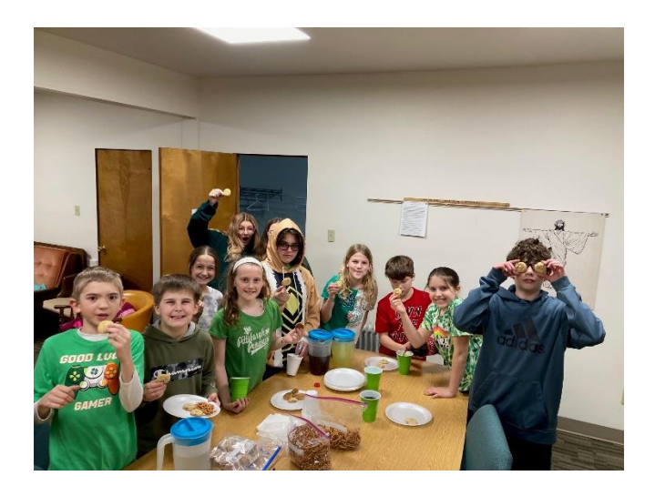
Having a great time as usual - the Youth Group continues to grow in numbers and in their faith!