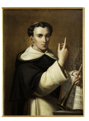
Feast Day: April 5

Readings for Palm Sunday, April 10, 2022 Isaiah 50:4-7 Philippians 2:6-11 Luke 22:14-23:56