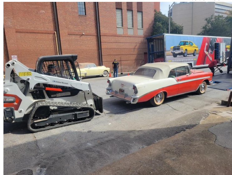
On the way to Mecum