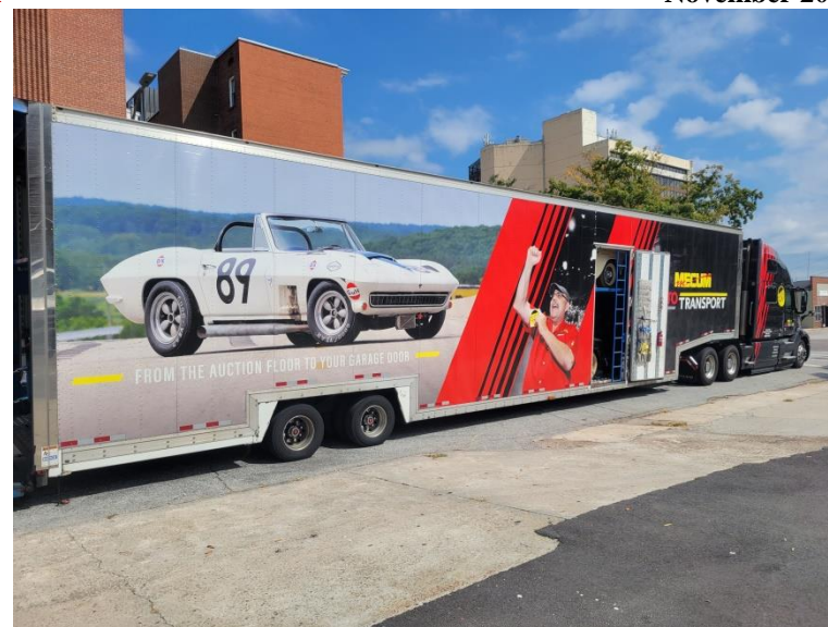
John Force's collection headed to the Mecum Auction