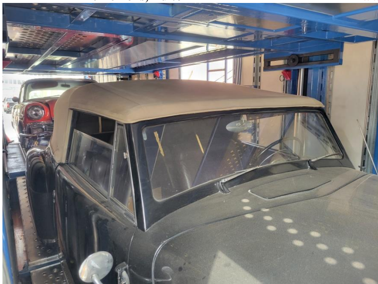
On the way to Mecum

Time to buy your Christmas Party tickets as well as renew your membership for 2023