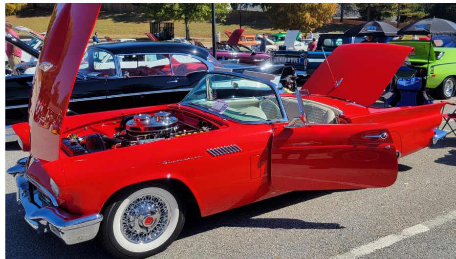
Charles Durand's 57 T-Bird

People's Choice Lost in the 50's car show