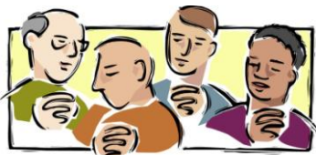
MEN'S PRAYER GROUP

Every Thursday Night at 6:30 p.m. in the Conference Room!