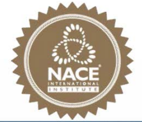
Executive Director \mathcal{U} NACE International Institute