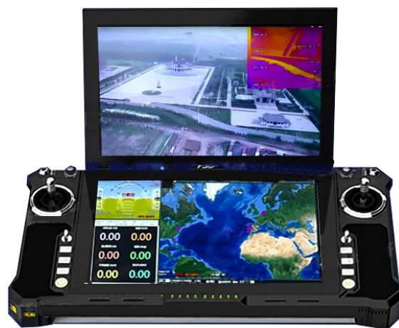
Geospace Industrial dual-screen remote Controller

Delivered in flight case with included accessories 4 sets of batteries (2 hours continuous flight time) 2 x 4-ch rapid charger systems (charge 2 complete sets of batteries at once) 6M payload lanyard with 100kg rating Cargo net for carrying loose items