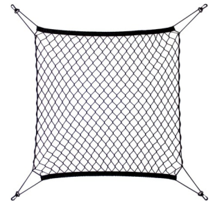
Cargo Net and 100kg Lanyard