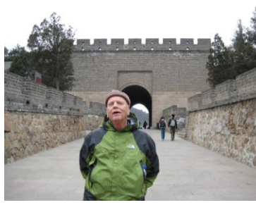
<< also on wall