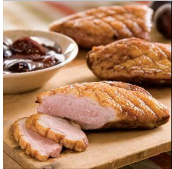
Fig and Shallot Compote For Pork Loin, Chicken, Duck