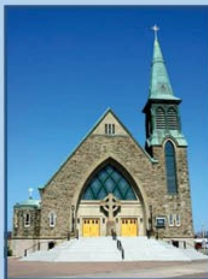
Saint Augustine's Moncton