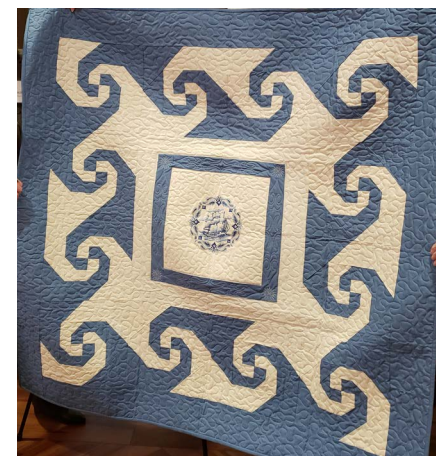
This quilt will be raffled off at our Fall Luncheon on November 23rd. See center detail on back page.

Note: The address of The Glen Club is 2910 WEST Lake Avenue and is accessed from Patriot Boulevard in The Glen, 1 mile north of E. Lake Avenue (the main thoroughfare). Drive north 1 mile on Patriot Blvd and turn left on West Lake Ave (just north of The Glen Town Center). Entrance to The Glen Club is on the left.