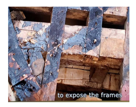
A video presentation documents and explains the re-building process.