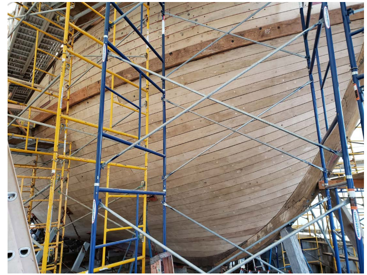
The museum features an exhibit documenting the history and restoration of Mayflower II. Exterior of the hull is shown above.