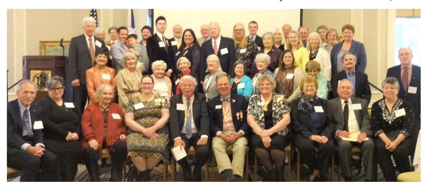
A first-time event for our Illinois Society! A group photo was taken at the end of the meeting for anyone who wanted to participate.