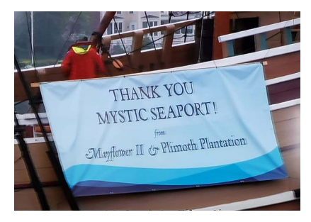
Mayflower II is owned by Plimouth Plantation. The restoration project is reportedly costing $7.5 million.