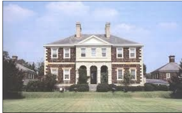
Mt Airy c.1752

We will also visit other historical homes in that area. Our Region is appreciative of their generosity in allowing us to pay them a visit.