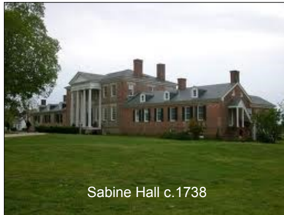
Sabine Hall c.1738

Friday morning, we will board a tour boat in Tappahannock and travel the Rappahannock River with a very knowledgeable docent explaining the many things that the riverfront supported during colonial days. Later we will enjoy lunch on our own at any of the many small restaurants in downtown Tappahannock, while we display our tour cars with the public in the area surrounding the Essex County Courthouse. We will also have a walking tour throughout the downtown area with another knowledgeable docent explaining the importance of some of the early homes in town.