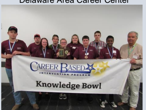
Third Place Delaware Area Career Center