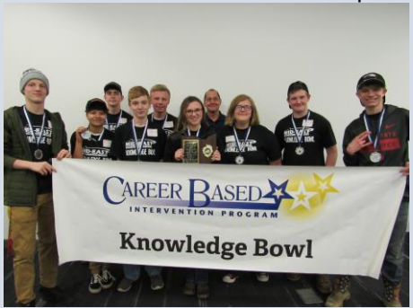
Second Place Mid-East CTC-Zanesville Campus