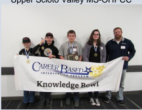
First Place Upper Scioto Valley MS-OHPCC