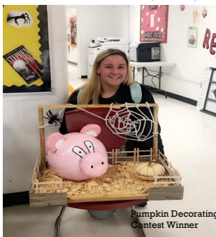
Pumpkin Decorating Contest Winner