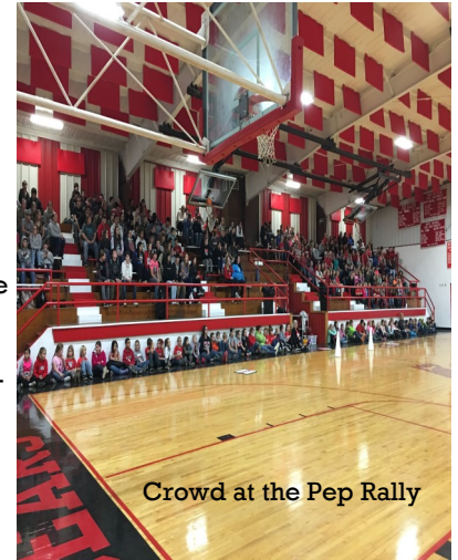
Crowd at the Pep Rally