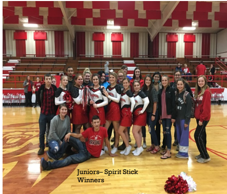
Juniors-Spirit Stick Winners