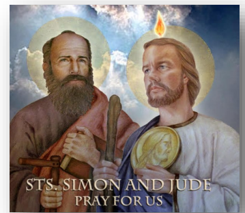
Feast Day: October 28

Sources: franciscanmedia.org and businessmirror.com