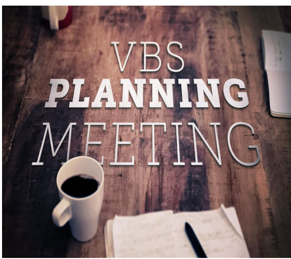
Sunday, March 12th after church