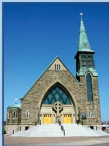
Saint Augustine's Moncton