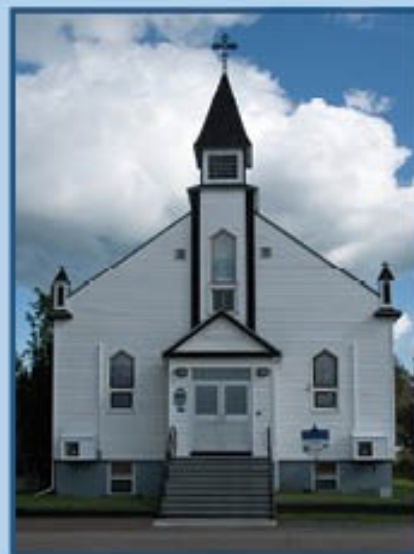
Our Lady of Mercy Pointe-du-Chêne