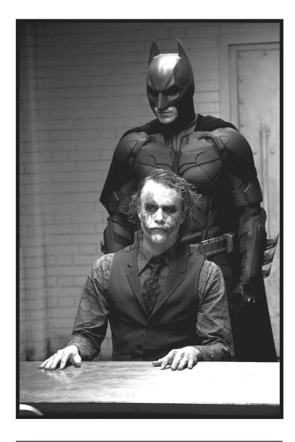
Photo 7.1 Batman (Christian Bale) and Joker (Heath Ledger). Both are deviant social outcasts in The Dark Knight .

Batman: It's not exactly a normal world, is it?