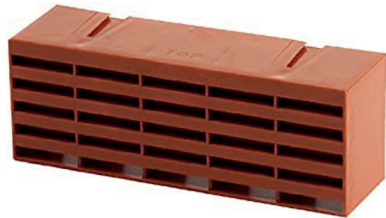
Air brick (terracotta)

These are all indicators of poor ventilation. Feed any concerns through to management.