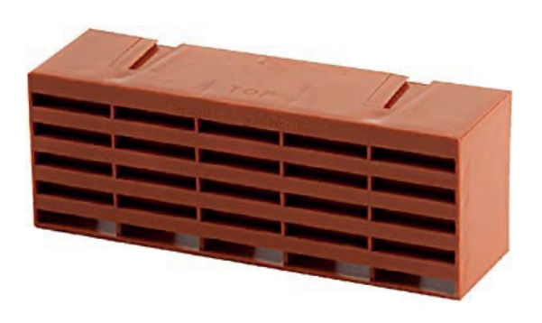
Air brick (terracotta)

These are all indicators of poor ventilation. Feed any concerns through to management.