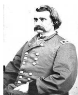
General John A. Logan

By the late 1800s, many communities across the country had begun to celebrate Memorial Day and, after World War I, observances also began to honor those who had died in all of American's wars. In 1971, Congress declared Memorial Day a national holiday to be celebrated the last Monday in May. (Veterans Day, a day set aside to honor all veterans, living and dead, is celebrated each year on November 11.) Today, Memorial Day is celebrated at Arlington National Cemetery with a ceremony in which a small American flag is placed on each grave. Also, it is customary for the president or vice-president to give a speech honoring the contributions of the dead and lay a wreath at the Tomb of the Unknown Soldier . About 5,000 people attend the ceremony annually.