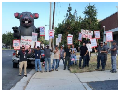
CWA Local 9586 Alondra C.O.

The Company continued with their retrogressive agenda proposing to adversely affect the transfer process in addition to eliminating job security...IT'S TIME TO SHOW FRONTIER THAT ENOUGH IS ENOUGH!