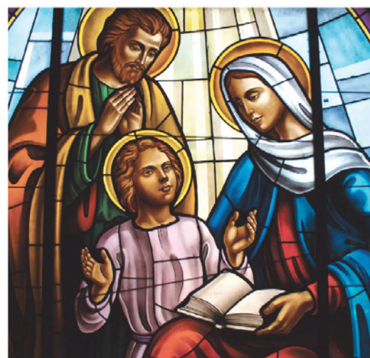
HOLY FAMILY / IMMACULATE CONCEPTION CATHEDRAL, EAST TIMOR

The roles of Mary and Joseph in this new family of Jesus were not to be only earthbound parents but, more importantly, to be examples of how to follow God's purpose. Both Mary and Joseph accepted God's path for them, even though they didn't know where the path would take them.