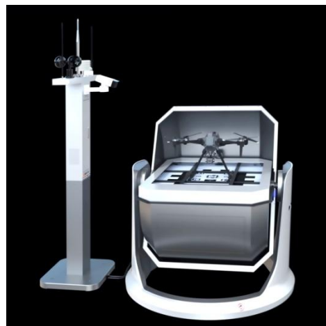
Opening the enclosure