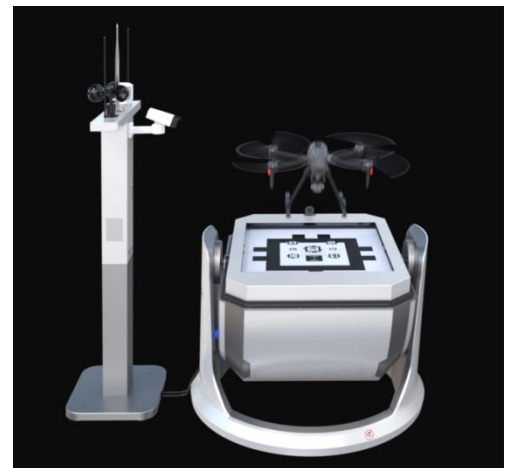
deploying the drone