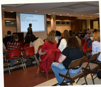
Parent Session at PHS