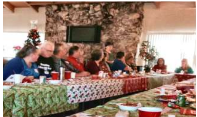
Lots of visiting going on.