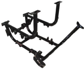
Part Name: Rear Sub-frame Part No.: HLP-290011 Remark :for 4X4, CLX