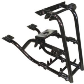
Part Name: Front Sub-frame Part No.: HLP-290012 Remark: for 4X4, CLX