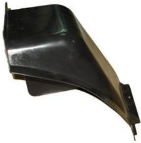
Part Name: Rear Right Wheel House Part No.:HEL2-3102002