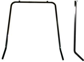
Part Name: Front Strut for Sun Top Part No.: HLP-290044