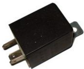
Part Name: Flasher Part No.: HEL2-3760460 Remark: Electric Flashing device for turning lights