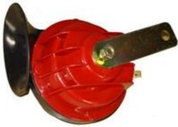
Part Name: Horn Part No.: HEL2-3760210 Spec: 12V