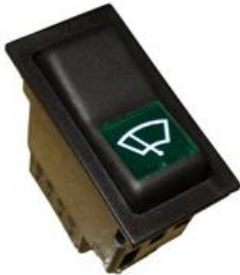
Part Name: Windshield Wiper Switch