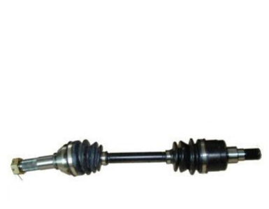
Part Name: Rear Left Half Shaft Part No.: HLP-220007L