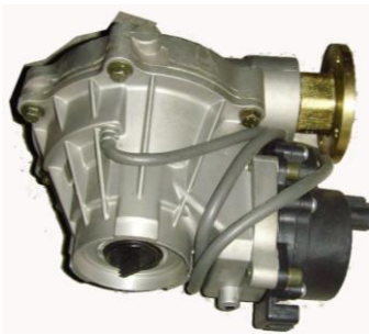
Part Name: Front Differential Housing Part No.: HLP-220001 Remark: 4X4, CLX