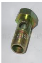
Part Name: Banjo Bolt M10-1.25x24 Part No: 10+1+35+00005