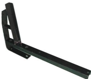
Part Name: Seat Back Support (Right) Part No.: HEG6-6800410