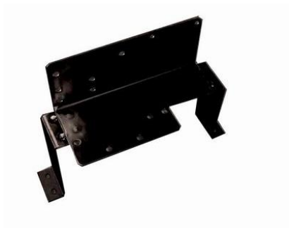
Part Name: Solenoid Bracket Part No.: HLP-370045