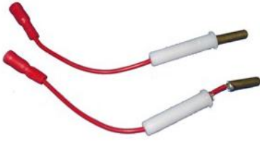
Part Name: Horn Wire Part No.: HLP-370006