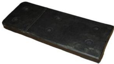
Part Name: Accelerator Pedal Pad Part No.: HEL2-2001013