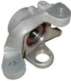
Part Name: Left Front Spindle Carrier Part No.: HLP-340002 Remark: Bearing Part No: DAC30600037