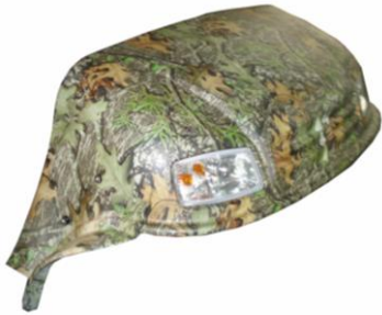
Part Name: Front cowl Part No.: ARMOFC02 ( Mossy oak obsession ) Part No.: ARMOFC01 ( Mossy oak breakup ) Part No.: ARMOFC03 ( Mossy oak brush )