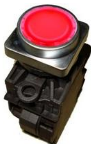
Part Name: EDS Button SLA42-21BNZS-Red Part No.: HLP-370013 Color: red