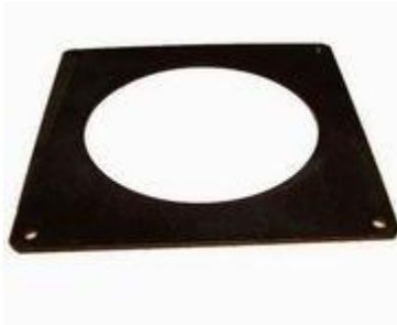
Part Name: Speedometer Panel Ø85 Part No.: 10-000-0601