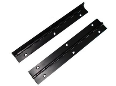
Part Name: Storage Box Door Hinge Part No.: HLP-290026 Remark: Connecting Storage Box Door to Storage Box