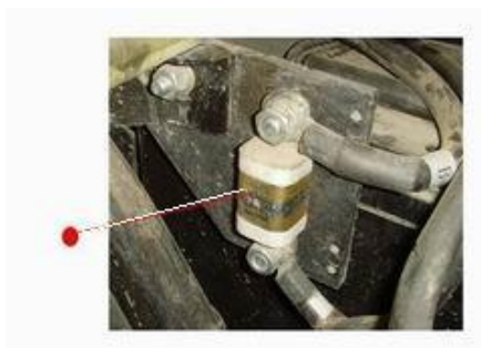
Part Name: FUSE Part No.:HLP-370012 Spec:250V400A