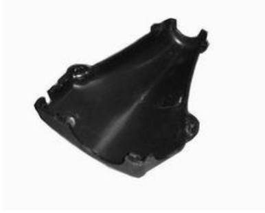
Part Name: Lower Lock Cover Part No.:HEL2-3400002 Remark: Assembled on Steering Column, Covering Group Switch