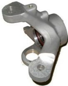
Part Name: Right Front Spindle Carrier Part No.: HLP-340003 Remark: Bearing Part No: DAC30600037