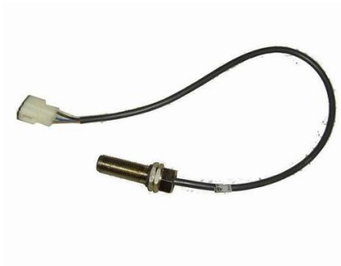
Part Name: Speed Sensor Part No.: 10+1+22+00400S Remark: Mounts on the Rear differential