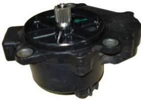
Part Name: Transfer Case Part No.: HLP-220002