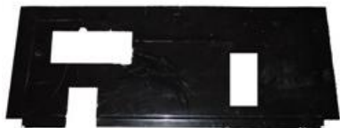
Part Name: Front Floor Sheet Part No.: HLP-290014 Remark: 4X4, CLX