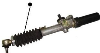
Part Name: Seal for Steering Box ASSY Part No.: HLP-340004BT Remark: 4X4, CLX