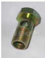
Part Name: Banjo Bolt M10-1x22 Part No.: 10+1+35+00006