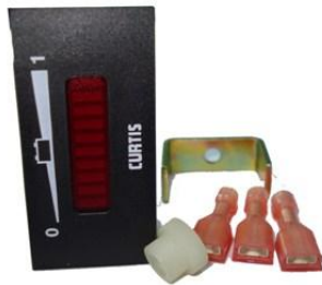
Part Name: Charge Meter Part No.: HEL2-3760310