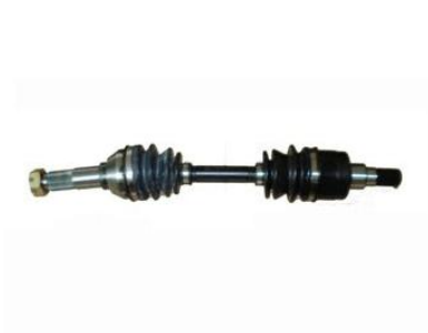
Part Name: Rear Right Half Shaft Part No.: HLP-220007R