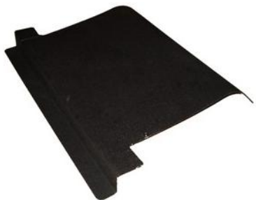
Part Name: Access Panel Part No.: HEL2-5600004