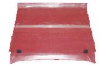
Part Name: Folding Windshield Part No.: 1019B64 (clear) Part No.: 1019C64 (tinted) Remark: Accessory