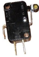
Part Name: Micro Switch Part No.: HEL2-3750110 Spec:V-16G-1C25