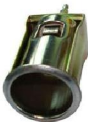
Part Name: 12Volt Receptacle Part No.: HEL2-3760470 Spec: 12V