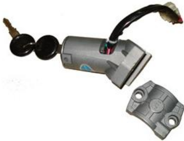
Part Name: Ignition Switch Part No.: HEL2-3440000