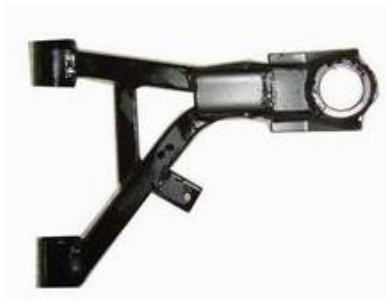
Part Name: Front Right Left Upper Arm Part No.: HLP-290005R