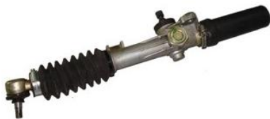
Part Name: Steering Box ASSY Part No.: HLP-340004 Remark: 4X4, CLX