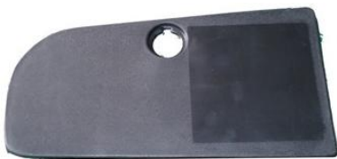
Part Name: Left Storage Box Door Part No.: HLP-5300201