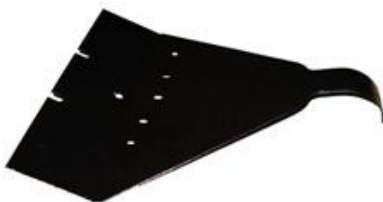
Part Name: Front Cowl Bracket Part No.: HLP-290015 Remark: for 4X4, CLX support the front cowl