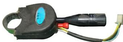
Part Name: Turn Signal Switch Part No.: HEL2-3440010