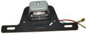
Part Name: License Plate Light Part No.: HLP-370001 Spec: 12V