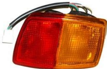
Part Name: Right Taillight Part No.: HEL2-3760200 Spec: 12V Wiring Harness: HEL2-3760EC-WIR