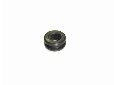
Part Name: Plastic ring for brake cable Part No.: 10+1+35+00604