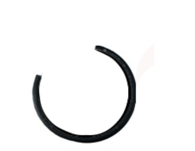
Part Name: Steel Wire Retainer for Drive Shaft Part No.: 10+1+22+00404 Remark: For Drive Shaft