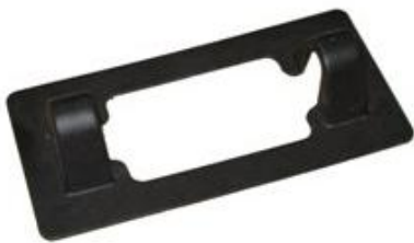
Part Name: Accelerator ASSY Pad Part No.: HLP-370044