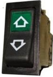
Part Name: Forward/Reverse Switch