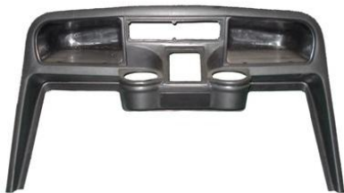
Part Name: Front Cowl Inner Part Part No.: HLP-290023