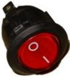
Part Name: Rocker Switch KCD1-106