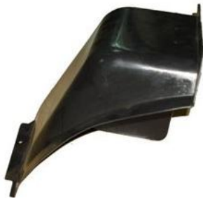
Part Name: Rear Left Wheel House Part No.: HEL2-3102001