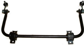
Part Name: Sway Bar Part No.: HLP-290004 Remark: 4x4, CLX Sway Bar Joint StabLizer HLP-290004J