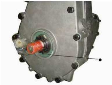
Part Name: Seal for drive shaft Part No.: Seal60x80x8