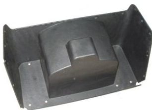
Part Name: Motor Protective Cover Part No.: HLP-290039