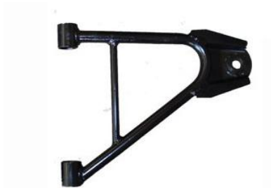
Part Name: Front Right Lower Arm Part No.: HLP-290006R Remark:4X4, CLX