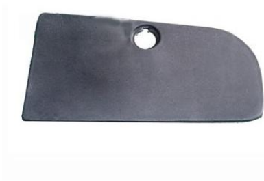
Part Name: Right Storage Box Door Part No.: HLP-5300201