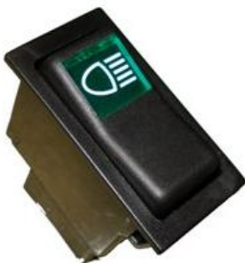
Part Name: Headlight Switch