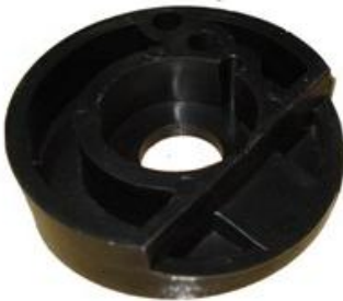
Part Name: Brush Socket Part No.: HEL2-3400061 Remark: Assembled between Steering Wheel and Steering Column. Horn Wire is assembled on it