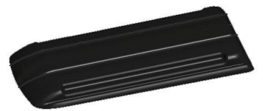
Part Name:4*4 Sun Top Part No.:2.03.250009 ( Black