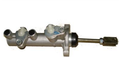
Part Name: Brake Master Cylinder Part No.: HLP-350006