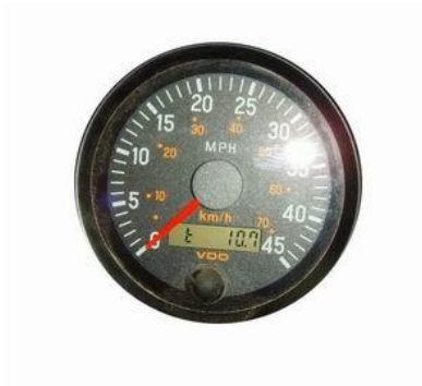
Part Name: Speedometer Part No.: 10-000-00602