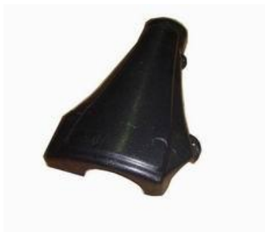
Part Name: Upper Lock Cover Part No.:HEL2-3400003 Remark: Assembled on Steering Column, Covering Group Switch