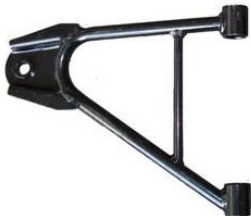
Part Name: Front Left Lower Arm Part No.: HLP-290006L Remark:4X4, CLX