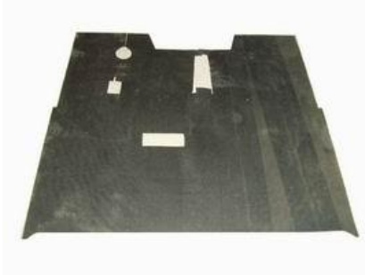
Part Name:2P Floor Mat Part No.:HLP-290033