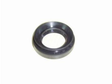
Part Name: Seal for front half shaft Part No.: HLP-220104 Spec: 38*24*7/11.5