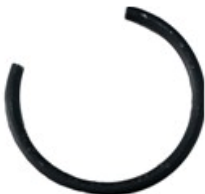
Part Name: Steel Wire Retainer for Front Left Half Shaft Part No.: 10+1+22+00201 Remark: For Front Left Half Shaft