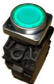
Part Name: 4WD Button A42-12BNZS-green Part No.: HLP-370014 Color: green