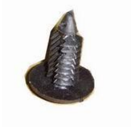
Part Name: Plastic rivet Part No.: 10+1+50+00011