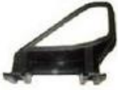
Part Name: Right Hip Restraint Part No.: HEL2-71000012