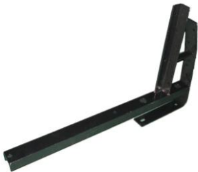
Part Name: Seat Back Support (left) Part No.: HEG6-6800420