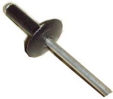
Part Name: big head rivet 4.8*18 Part No.: 30+442+F1+4.8+18 Remark: riveting the front cowl