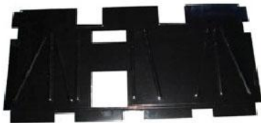
Part Name: Center Floor Sheet Part No.: HEL2A-2101001 Remark: 4X4, CLX