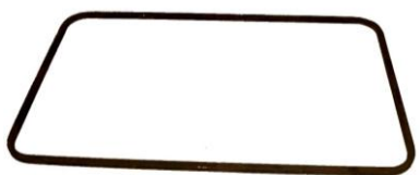
Part Name:2P Sun Top Frame Part No.:HLP-290032