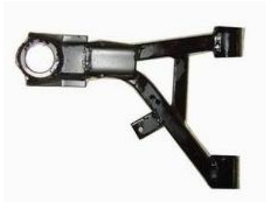
Part Name: Front Left Upper Arm Part No.:HLP-290005L Spec: Main Material:Q235 Color: black Remark: 4X4, CLX