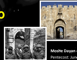
Moshe Dayan entering the Lion's Gate in Jerusalem Pentecost: June 7, 1967