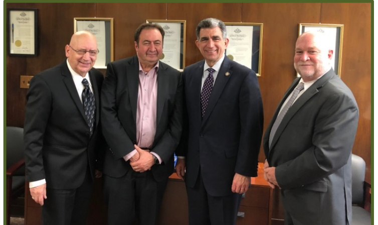
Auto Collision shop owners from across New York State visited to update me on their legislative agenda.