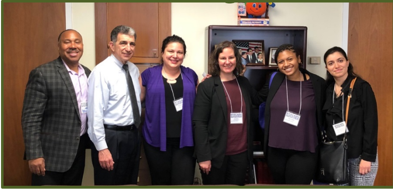
On Domestic Abuse Awareness Day, I met with representatives from Vera House to discuss legislation relating to domestic abuse.