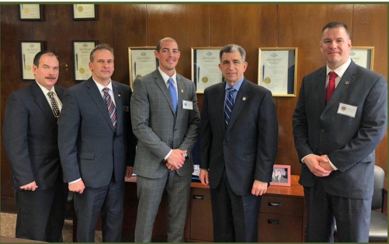
The Police Benevolent Association of New York State represents state police officers who are not troopers - SUNY police, Forest Rangers, Park Police and DEC Enforcement Officers. They were in to discuss their legislative agenda for this Assembly session.