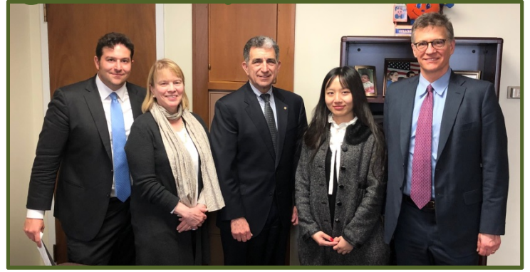
The Democratic Lawyers Council visited to discuss voting and election law reforms.