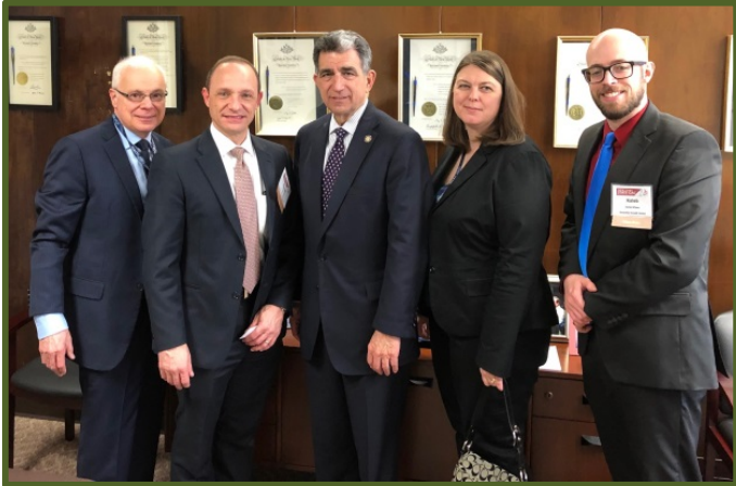
Credit Union representatives from AmeriCU and ACMG met to converse about changes that would affect local credit unions.