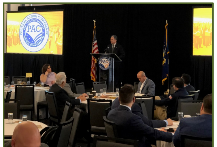
Assemblyman Magnarelli was honored to speak at the Laborers Legislative Breakfast on May 15.