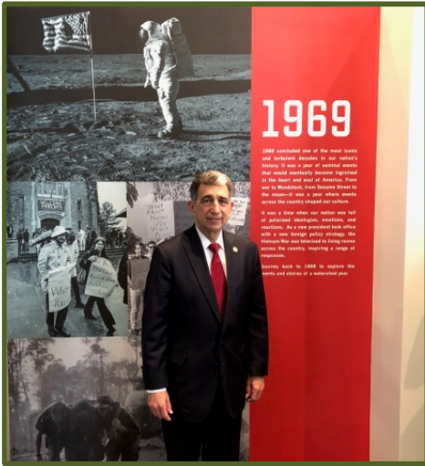
WBM attended the opening ceremony for an exhibit in Albany of the 50th Anniversary of "1969" honoring veterans of the Vietnam War. Governor Andrew Cuomo and the Office of General Services created the exhibit, which explores the end of one of the most iconic and turbulent decades in United States' history. Located in the Abrams Justice Building Atrium, it runs through the end of the year. 1969 was a year of seminal events that became ingrained in the heart and soul of America. From war to Woodstock and from Sesame Street to the moon, it was a year where events across the country shaped our culture. It was a time in our history when our nation was full of polarized ideologies, emotions, and reactions. As a new president took office with a new foreign policy strategy, the Vietnam War was televised to living rooms across the country, inspiring a range of reactions and responses.