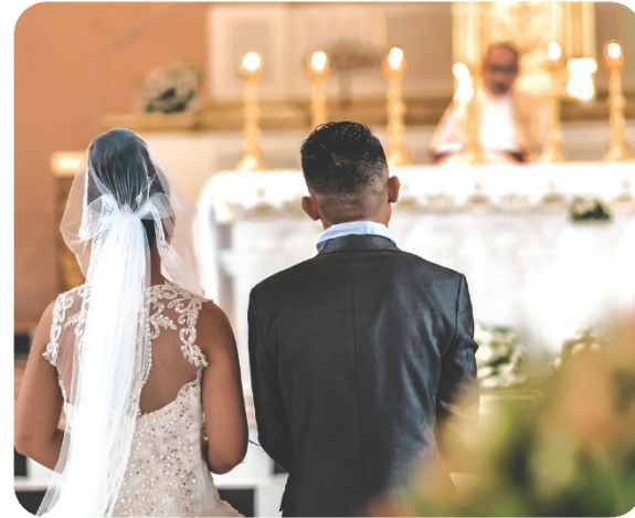
MIDY EDWARDS / SHUTTERSTOCK