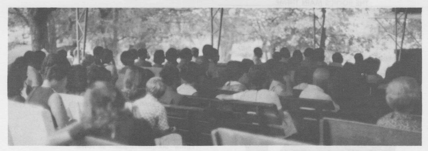
Under the Tabernacle during an afternoon service